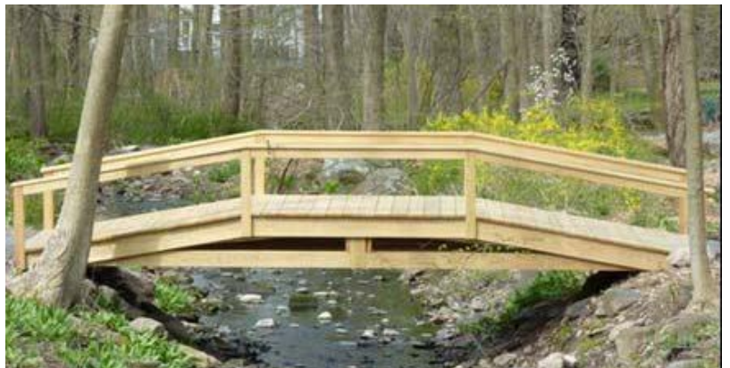
A new wooden bridge, similar to the one pictured above, will be installed along the new walking path at Evergreen Road and Woodland Road.

The City of Anchorage would like to thank the residents along Evergreen Road that granted easements on their property for the walking path. The City appreciates your patience for the long delays caused by the inclement weather. The City has two more walking path projects underway: Bellewood Road from the Anchorage School to North Arbor Drive and Osage Road East from Evergreen Road to Stone Gate Road. A new Wagner Park connector from Hazelwood Road to the Osage Road Entrance of Wagner Park is also planned. Stay tuned to Reach Alert for traffic delays and construction notices.