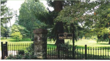
Anchorage Forestry Calendar 2017 Anchorage Iron Works